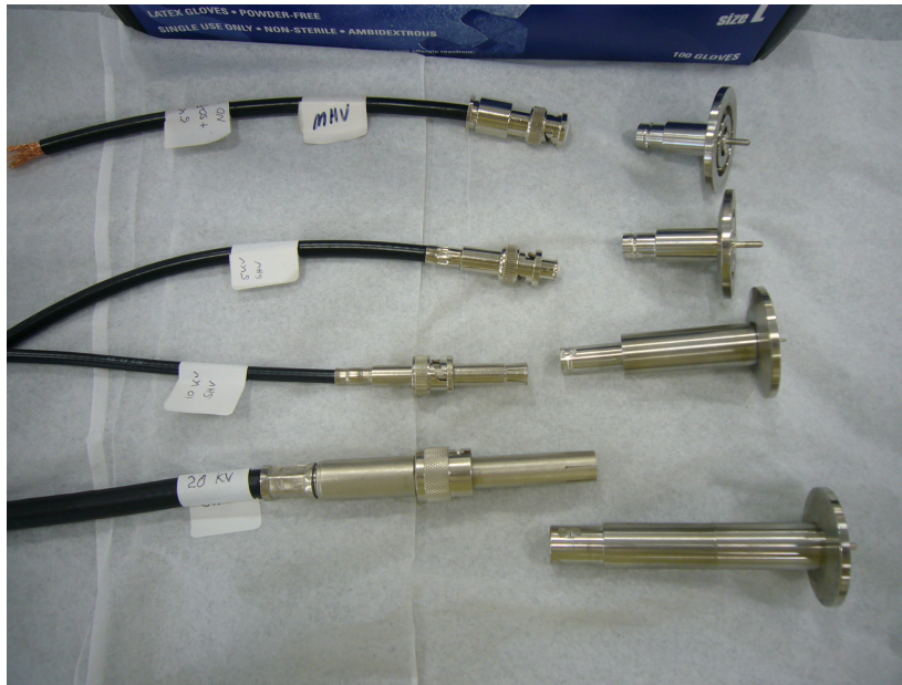
Figure 3: HV Receptacles with Plugs/Cables