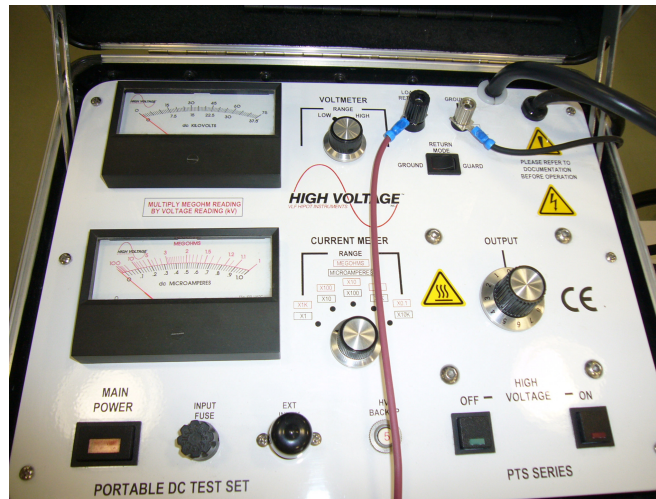
Figure 1: High Voltage DC test set

Equipment: Diffusion Pumped Hot wall Vacuum Furnace High Voltage Portable DC test set (see Figure 1 ) Granville Phillips 340 Vacuum Gauge Controller (see Figure 2 )